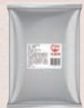
Aluminum Pouch 5KG

Made from carefully selected, fully ripened tomatoes with zero additives. This versatile, essential ingredient is ideal for a wide range of Western and Asian dishes, from hearty stews and flavorful sauces to savory soups.