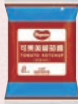
Pouch 3KG / 5KG