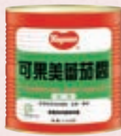
Can 3.33KG / 4.5KG