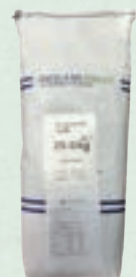
PE Bag 25KG