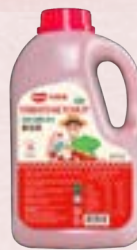
Plastic Jug 3.15KG